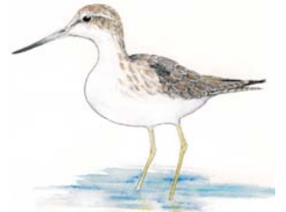
Common Greenshank Tringa nebularia

As the lakes dry out, waders may be seen feeding along the edges of the lakes. They may include Black-winged Stilts, Black-fronted Dotterels and Common Greenshanks.