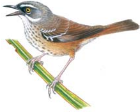
White-browed Scrub-wren Sericornis frontalis

A beach search may yield sea and shore birds including Caspian and Crested Tern.