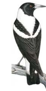
Australian Magpie Gymnorhina tibicen