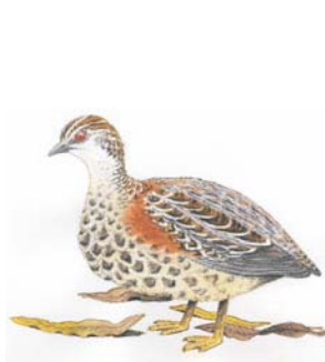
Painted Button-quail Turnix varia