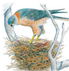
Brown Goshawk Accipiter fasciatus