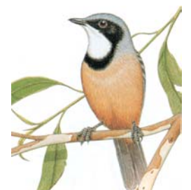
Rufous Whistler Pachycephala rufiventris