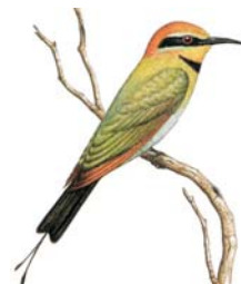
Rainbow Bee-eater Merops ornatus

In summer the migrant Rainbow Bee-eaters come down from the north. They breed in their underground tunnels.