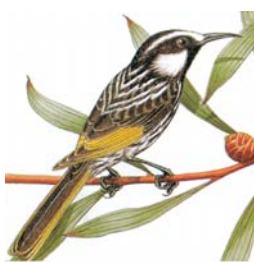
White-checked Honeyeater Phylidonyris nigra

Bold Park occupies an area of over 150 ha. There are several landforms, soil types and diverse vegetation and sixty-five species of bush birds have been recorded as residents, visitors or migrants.