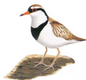
Black-fronted Dotterel Elsayornis melanops