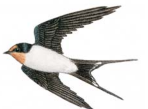
Welcome Swallow Hirundo neoxena