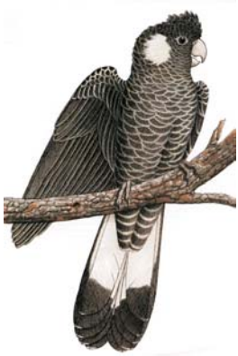
Short-billed Black-Cockatoo Calyptrorhynchus latirostris

The most abundant birds in the park are the honeyeaters. In the western section, numbers increase when the red-flowering Templetonia (One-sided Bottlebrush) are in bloom.