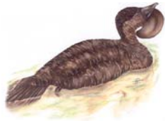
Musk Duck Biziura lobata