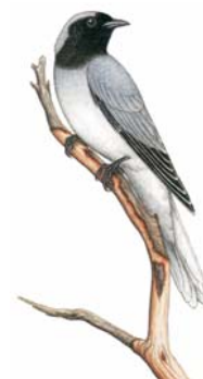
Black-faced Cuckoo-shrike Coracina novaehollandiae