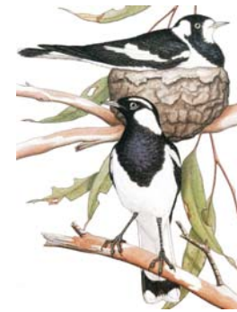
Magpie-lark Grallina cyanoleuca

The rushes around the eastern lake are home and breeding area for birds including Purple Swamphen and Dusky Moorhen.