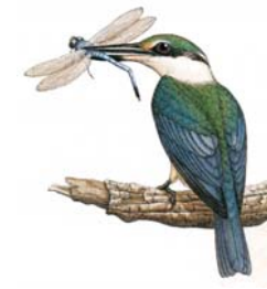
Sacred Kingfisher Todiramphus sanctus