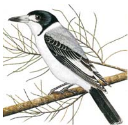
Grey Butcherbird Cracticus torquatus

The Banksia woodland is a good area for Grey Butcherbird and Red and Little Wattlebird.