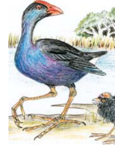
Purple Swamphen Porphyrio porphyrio

The open water provides good views of ducks, swans, grebes and coots.