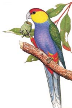
Red-capped Parrot Purpurecephalus spurius