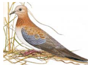
Laughing Turtle-dove Streptopelia Senegalensis