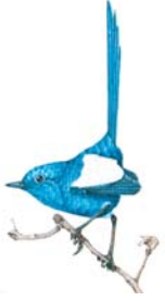
White-winged Fairy-wren Malurus leucopterus

The dunes are also a good area for White-browed Scrub-wren and the less common Variegated Fairy-wren.