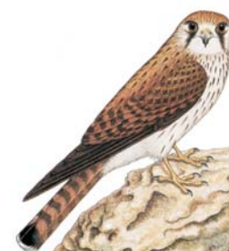
Nankeen Kestrel Falco cenchroides

Several raptors visit the area including the Australian Hobby, Brown Goshawk and Nankeen Kestrel. They are often seen hovering in their search for food.