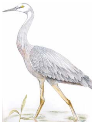
White-faced Heron Egretta novaehollandiae