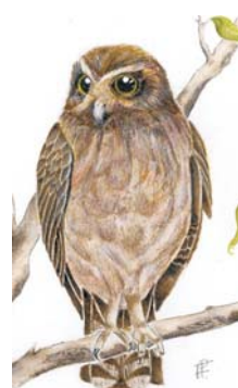
Southern Boobook Ninox novaeseelandiae