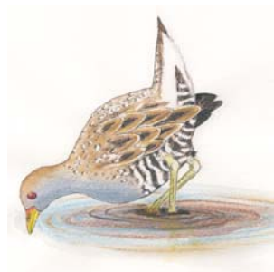
Australian Spotted Crake Porzana fluminea