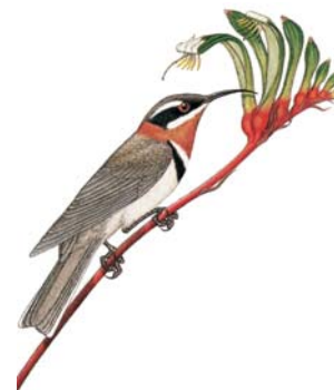
Western Spinebill Acanthorhynchus superciliosus