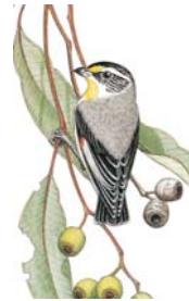
Striated Pardalote Pardalotus striatus

The Tuart Woodland provides nesting hollows for many birds including the Striated Pardalote. Listen for its loud call, 'chip-chip'. They feed among the higher branches.