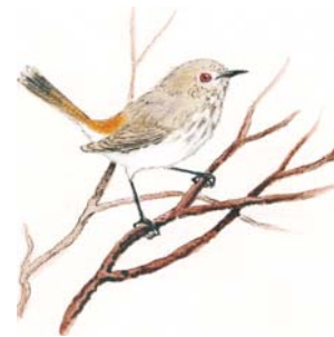
Inland Thornbill Acanthiza apicalis