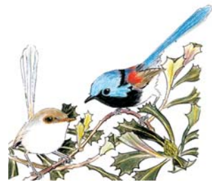
Variegated Fairy-wren Malurus lamberti