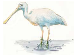
Yellow-billed Spoonbill Platalea flavipes

Look among the trees for bush birds. You should see a flock of Little Corella. These flocks began as cage escapees.