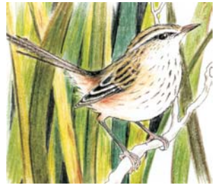
Little Grassbird Megalurus gramineus

Further north along the lake you will come to sedges and bulrushes which provide a habitat for such species as Little Grassbird and Clamorous Reed-Warbler.