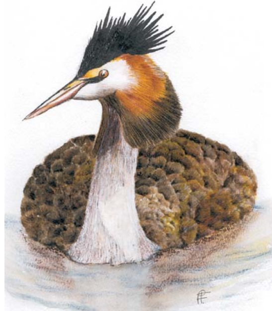
Great Crested Grebe Podiceps cristatus

Funded by Community Assistance Program TOWN OF CAMBRIDGE