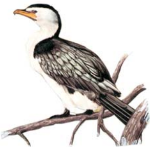
Little Pied Cormorant Phalacrocorax melanoleucus