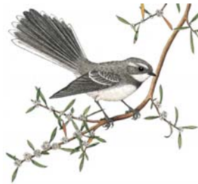
Grey Fantail Rhipidura fuliginosa

Some small insectivorous species such as the Grey Fantail and Western Gerygone move northwards through the metropolitan area in winter and are then abundant in Bold Park.