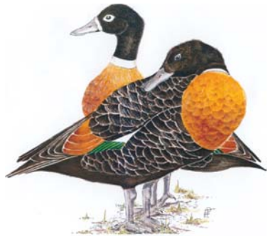
Australian Shelduck Tadorna tadornoides