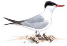
Caspian Tern Sterna caspia

White-winged Fairy-wren are quite common and roam widely in groups of eight to twelve among the dune plants at Floreat Beach near Hale Road.