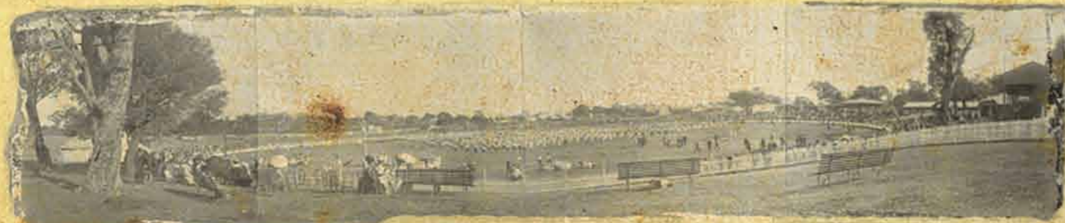
Royal Agricultural Society Grounds 1905-1912

Many ex-patrons say (although no doubt many Claremont residents would disagree) that nothing compared to the atmosphere, smell, noise, crowds and great racing that used to be the Claremont Speedway. For over 70 years, from 1927 to 2000, the Claremont Speedway, held on the Royal Agricultural Society grounds, was one of the oldest running speedway venues in the world. Unlike today's speedways patrons were able to get up close to the action with only a fence between them and the racing. Over the years there were eighteen fatalities, including one spectator at the speedway.