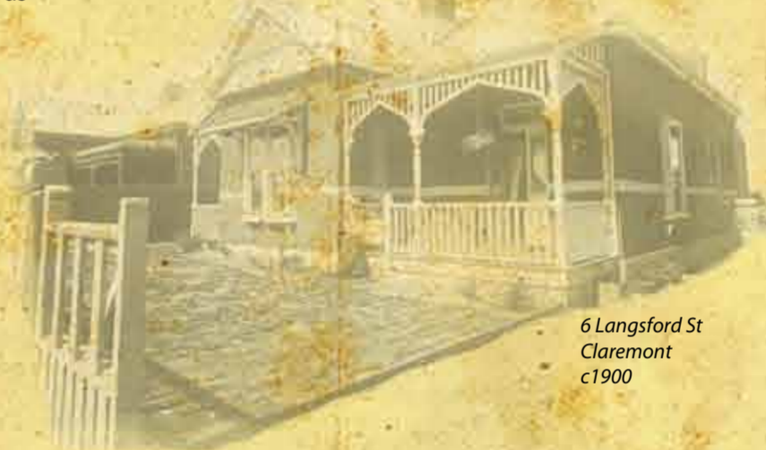
6 Langsford St Claremont c1900

In 2001 Wyandra was sold to a private owner which saw it come under significant development pressure. The heritage listing on the place saved it from demolition.