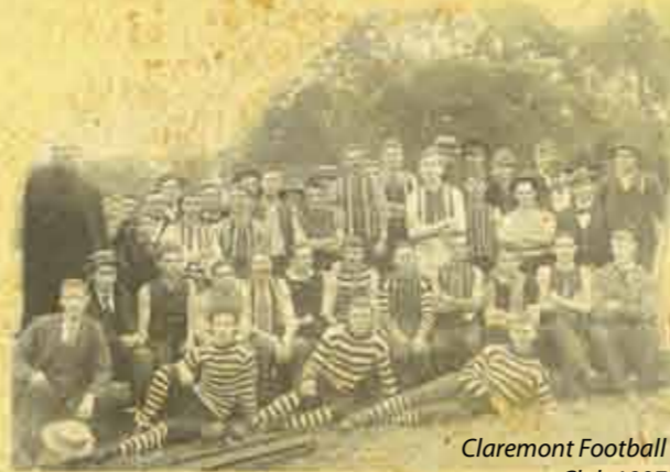
Claremont Football Club 1897

Due to its close proximity to the railway line and the size of the parcel of land offered by the State Government, the Royal Agricultural Society moved to Claremont from Guildford in 1902 and the first Show in Claremont opened on the 1st of November, 1905. The Show was initially a five day event: Tuesday was judging day, Wednesday the Opening Ceremony and Peoples' Day, Thursday Children's Day, Friday livestock sales and ring events and Saturday Horses-in-Action. The Show was considered the premier festive event of the year